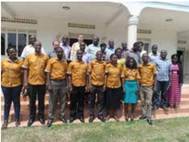
EHC group of experts 2016