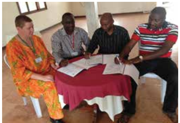
Partnership and collaboration with Universities